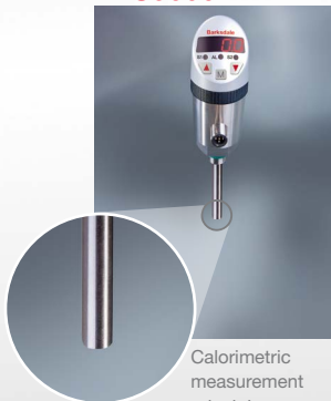
Calorimetric measurement principle