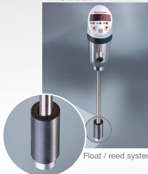
Float / reed system

Barksdale GmbH (Production Center) Dorn-Assenheimer Str. 27 61203 Reichelsheim Germany Tel.: +49 (0) 6035 949 – 0 Fax: +49 (0) 6035 949 – 111 info@barksdale.de www.barksdale.de